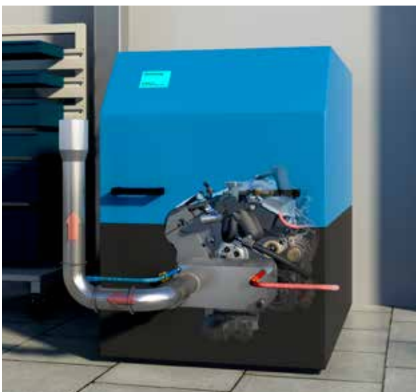
Combined heat and power

When used in heat recovery, Alfa Laval heat exchangers provide a fast ROI as well as huge environmental benefits. For low-pressure applications the combination of high performance with low pressure drop often offers payback within one year.